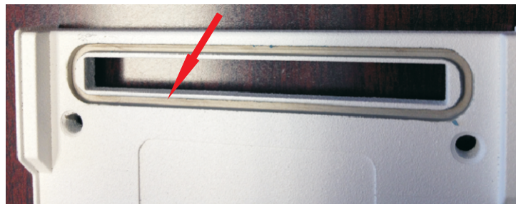
Paint removal inside of oval

Example of Powder Coat removal of build up from plugged hole. Customer was scraping powder using a sharp edge before discovering our technology.